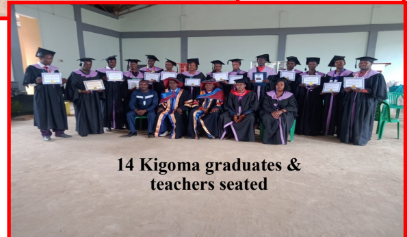
14 Kigoma graduates & teachers seated

renji is overseeing 27 training locations in six countries of Africa, seven of those