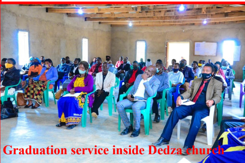
Graduation service inside Dedza church

Dedza continues to grow. We are now supporting the expansion of their work with CTC. Last month I received an update from Pastor Moses with their first CTC graduation of six students