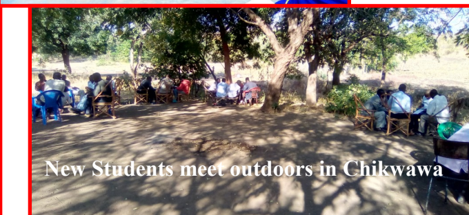
New Students meet outdoors in Chikwawa